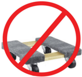
Four wheel dollies