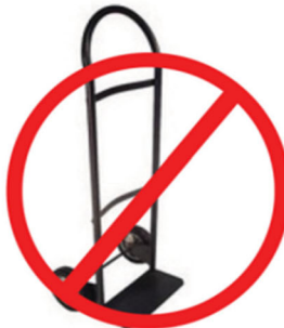
Two wheel dollies