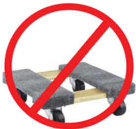
Four wheel dollies