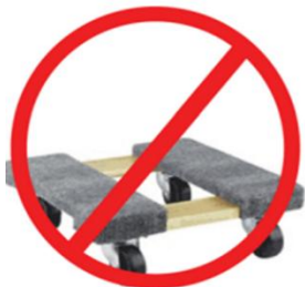
Four wheel dollies